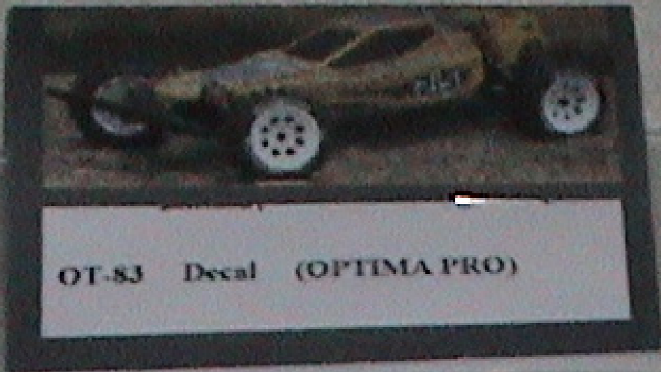
OT-83 Decal (OPTIMA PRO)