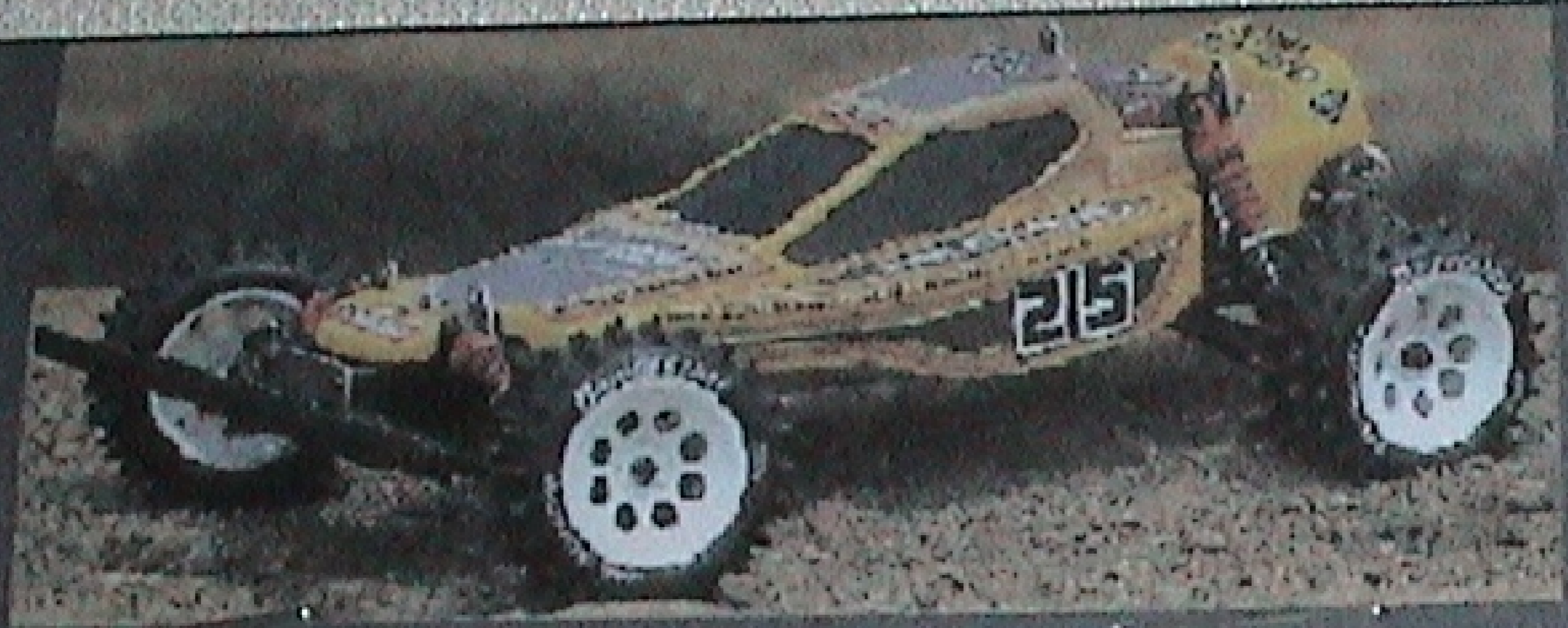
OT-83 Decal (OPTIMA PRO)