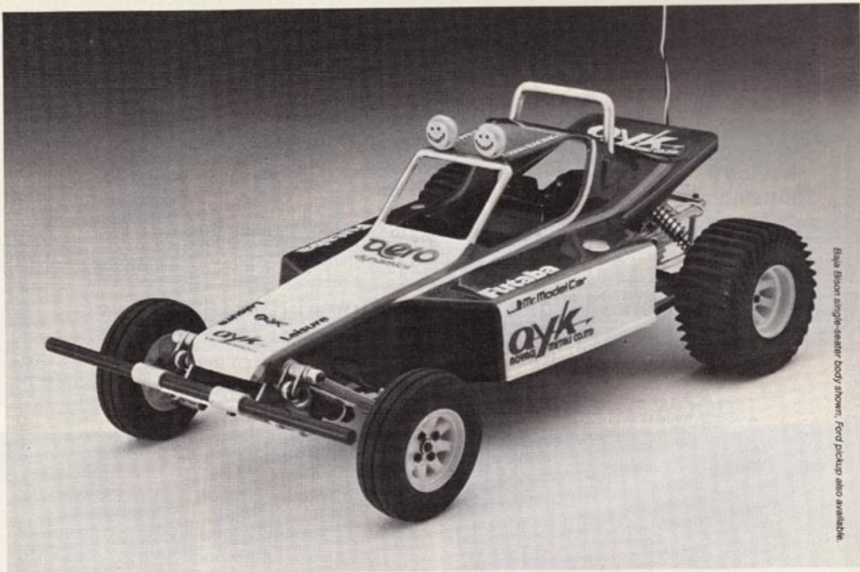
Single-seater body shown; Ford pickup also available.