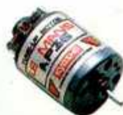
LeMANS AP36 No.1962