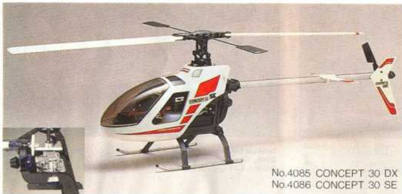
No.4085 CONCEPT 30 DX No.4086 CONCEPT 30 SE