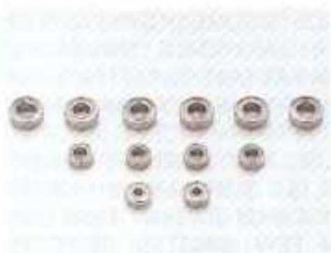
■ BALL BEARING SET No.1978

FOR LOTUS HONDA 99T/McLAREN MP4/3 TAG TURBO/WILLIAMS HONDA