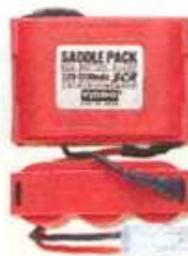
■ 7.2V-1200mAh SPRINT SCR SADDLE PACK NiCd BATTERY No.2331