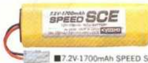
■ 7.2V-1700mAh SPEED SCE BATTERY No.2330E