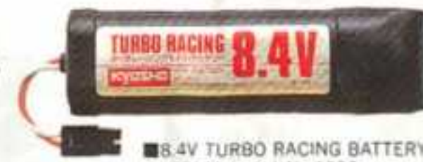
■ 8.4V TURBO RACING BATTERY (8.4V-1200mAh) No.1932