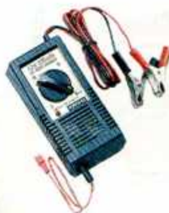
■ DC QUICK CHARGER (7.2V-270mAh) No.2332