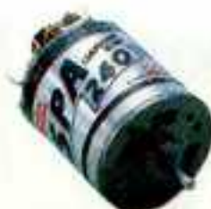
SPA 240WS No.W-1011