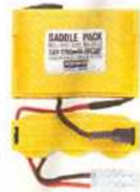
■ 7.2V-1700mAh SCE SADDLE PACK NiCd BATTERY No.2320