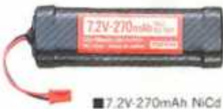
■ 7.2V-270mAh NiCd BATTERY No.2312