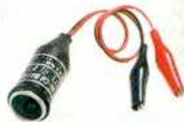
■ 12V BATTERY ADAPTOR No.2193