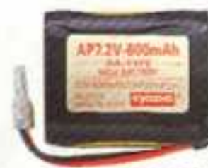
■ AP 7.2V-600mAh NiCd BATTERY No.2314