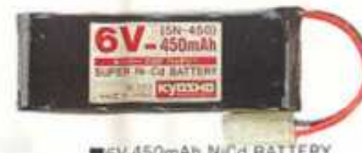
■ 6V-450mAh NiCd BATTERY No.2205