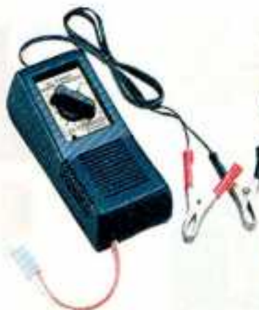
■ DC POWER QUICK CHARGER (7.2V-1200mAh) No.2326