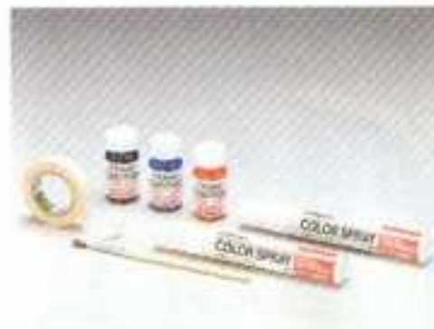
■ TEAM COLOR PAINT SETS ● CAMEL TEAM No.FRW-2 ● MARLBORO TEAM No.FRW-3 ● WILLIAMS TEAM No.FRW-4