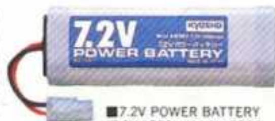
■ 7.2V POWER BATTERY (7.2V-1200mAh) No.2306

HIGH-QUALITY, HIGH-CAPACITY NICKEL CADMIUM BATTERIES FOR A VARIETY OF MODEL APPLICATIONS. ALL CAN BE QUICK CHARGED USING THE APPROPRIATE KYOSHO CHARGER AND A 12V CAR BATTERY. CAN TYPICALLY BE RECHARGED OVER 300 TIMES IF NOT OVERCHARGED OR OVERHEATED.