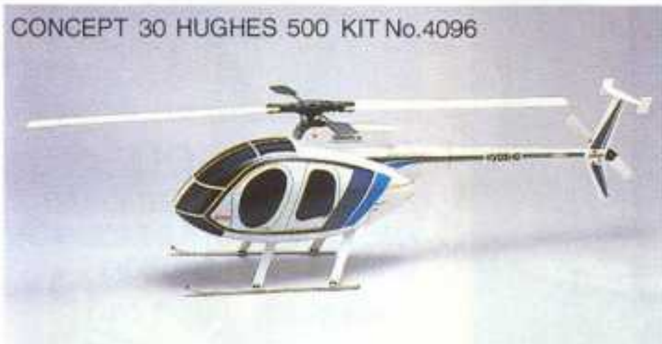
CONCEPT 30 HUGHES 500 KIT No.4096