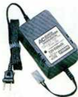
■ AC QUICK CHARGER (7.2V-1200mAh) No.2232