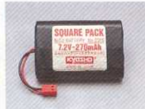
■ 7.2V-270mAh SQUARE PACK NiCd BATTERY No.2315