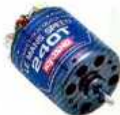
LeMANS SPEED 240T No.1986

ALL KYOSHO LeMANS AND SPA MOTORS ARE CUSTOM-DESIGNED FOR HIGH POWER OUTPUT AND RELIABLE SERVICE, REGARDLESS OF THE PRICE RANGE. FOUR STAFF MEMBERS WORK FULL-TIME DEVELOPING AND IMPROVING MOTOR DESIGNS, AND ALL MOTORS (AND PARTS USED IN THEM, EXCEPT BEARINGS) ARE PRODUCED IN KYOSHO'S OWN FACTORY IN LIMITED NUMBERS, SO THEY RECEIVE INDIVIDUAL ATTENTION (SEMI-HANDMADE).