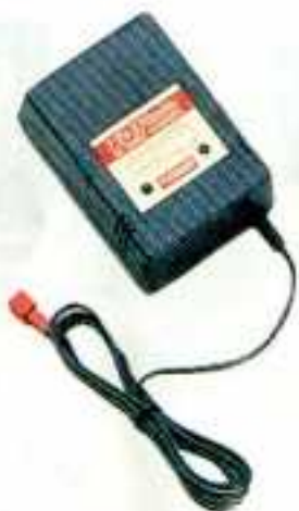
■ AC QUICK CHARGER (7.2V-270mAh) No.2342

THESE CHARGERS ARE ALL DESIGNED TO RECHARGE QUICK-CHARGE NiCd BATTERY PACKS IN 15 MINUTES (FULLY DISCHARGED PACK; LESS IF PARTIALLY CHARGED) USING A STANDARD 12V CAR BATTERY AS POWER SOURCE. ALL USE A RELIABLE TIMER TO SHUT OFF CHARGING CURRENT AFTER THE REQUIRED TIME. SUPPLIED CONNECTORS ARE FOR KYOSHO NiCd BATTERY PACKS. BUT ANY FAST-CHARGE NiCd PACK CAN BE RECHARGED USING A SUITABLE CONNECTOR. THREE CHARGERS ARE FOR SPECIFIC TYPES OF NiCd PACKS (VOLTAGE AND CAPACITY)