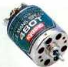
LeMANS SPEED 480T No.1988