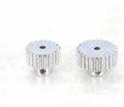
■ HARD PINION No.FRW-1