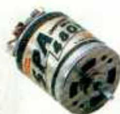
SPA 480WT No.W-1012