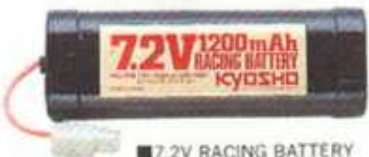
■ 7.2V RACING BATTERY (7.2V-1200mAh) No.2218