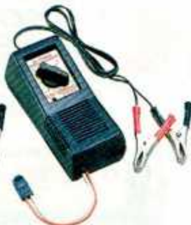
■ DC POWER QUICK CHARGER (8.4V-1200mAh) No.2327