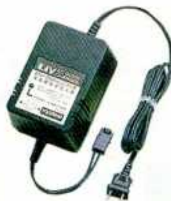
■ AC QUICK CHARGER (8.4V-1200mAh) No.1931