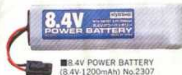
■ 8.4V POWER BATTERY (8.4V-1200mAh) No.2307