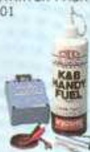
K&B STARTER PACK No.6401