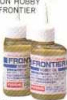
TEFLON HOBBY OIL, FRONTIER