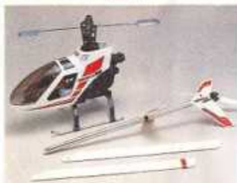
No.4087 CONCEPT 30 DX <WITHOUT ENGINE> No.4088 CONCEPT 30 SE <WITHOUT ENGINE> No.4089 CONCEPT 30 DX KIT No.4090 CONCEPT 30 SE KIT

THE "CONCEPT 30" IS ALMOST FACTORY ASSEMBLED. SERVOS AND LINKAGES ARE EASY TO INSTALL AND ADJUST. IT IS DESIGNED FOR MINIMUM MAINTENANCE AND READJUSTMENT. IT HAS FULL COLLECTIVE PITCH CONTROL AND THE ADVANCED HEAD DESIGN ENSURES THAT EVEN THE SMALLEST CONTROL INPUTS ARE FOLLOWED ACCURATELY AND HELD SECURELY. IT CAN BE USED FOR LEARNING BY A BEGINNING PILOT, THEN FLOWN WITH THE PERFORMANCE OF A COMPETITION MACHINE. THE POWER UNIT IS VERY COMPACT, WITH INTEGRAL FAN, CLUTCH AND STARTER CONE (EASILY REACHED). THE DRIVE GEAR IS CLOSE TO THE ENGINE FRONT BEARING, FOR MINIMUM LOAD ON THE CRANKSHAFT. LIGHT, ONE-PIECE TAIL ROTOR WITH SIMPLE, RELIABLE DRIVE.