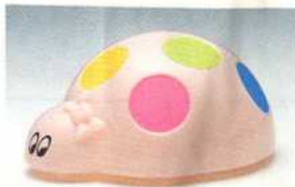
ELECTRO-LIGHT LADY BUG