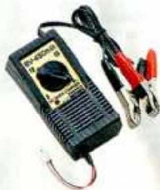
■ DC QUICK CHARGER (6V-450mAh) No.2365