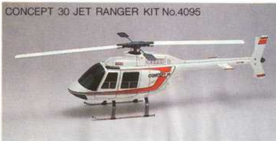
CONCEPT 30 JET RANGER KIT No.4095