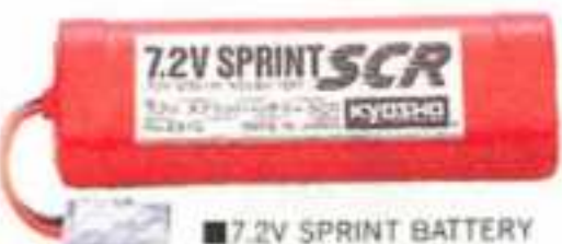
■ 7.2V SPRINT BATTERY (7.2V-1200mAh) No.2310